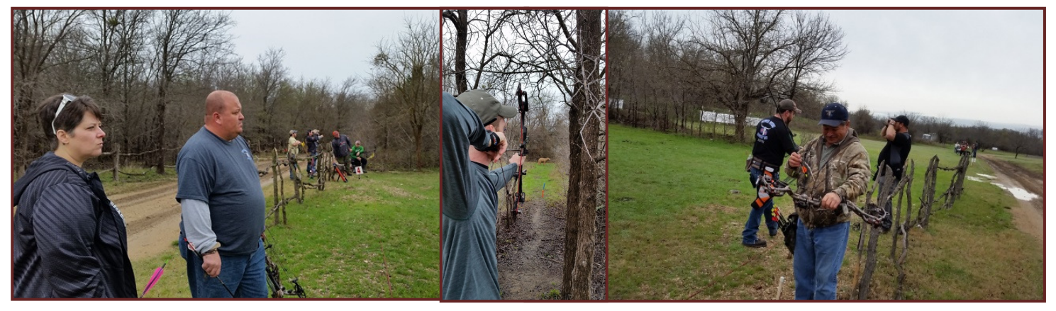
SUNDAY, MARCH 22<sup>ND</sup>, 2015 @ RAISE YOUR BOWS FOR RIO CANTU BENEFIT SHOOT IN GRANBURY

SATURDAY, MARCH 21<sup>st</sup>, 2013 @ DFWSOY SHOOT #1 @ CCR